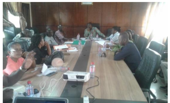
Pictures of Executive Committee Members in a meeting with the Planning Committee