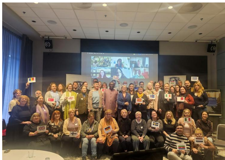
Delegates Meeting Attendees – Oslo, October 2025

These trends have presented new challenges for social work practice, values and ethics in many parts of the region. In this context, the resilience, connections and solidarity of IFSW Europe is ever more vital. Social workers across the world stand up for inclusive, participative democracy and social rights. In IFSW Europe we do this within key intergovernmental and independent European institutions and bodies, and on specific professional issues at national level.