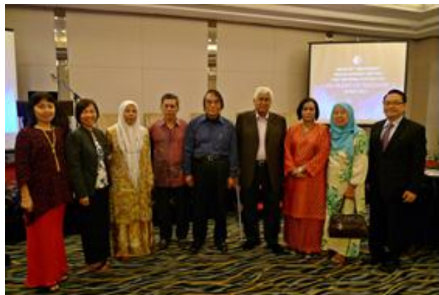
Pioneer social workers, past presidents and current members of the Executive Committee posing for a commemorative photograph

The Convention was closed following constructive and positive comments from the participants who requested for more of such events.