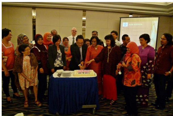
Cutting of MASW's 40th Anniversary cake

Four pioneer social workers, two of them past presidents of MASW and members were invited to cut the anniversary cake and proceeded to enjoy a buffet lunch.