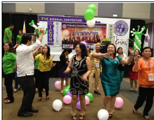
Happy Closing to PASWI Conference