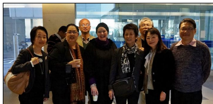
IFSW-AP Members @ IFSW General Meeting, Melbourne University