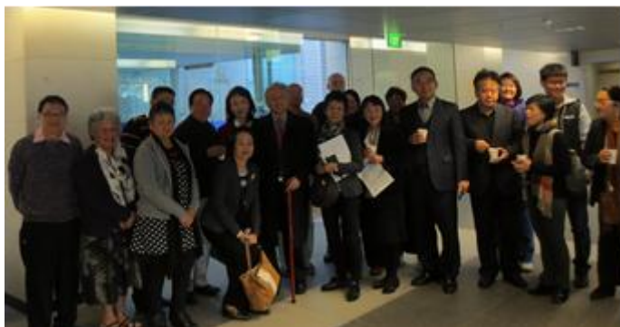
Group of IFSW-AP Members after the Regional Meeting

Our next meeting will be in Thailand in 2015.