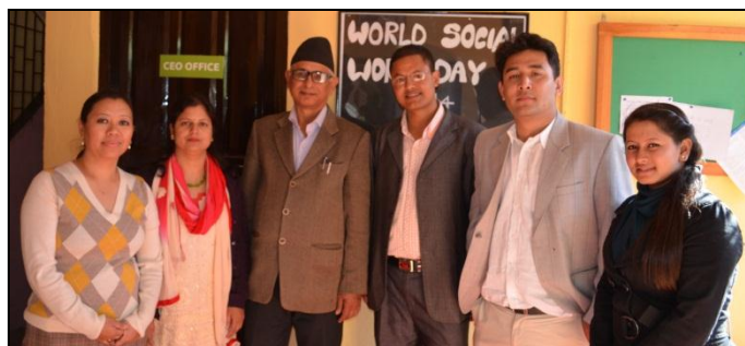
Founding Members of SWAN

SWAN is a national professional association representing social workers in Nepal, and established on June 29, 2014. It is also a member organisation of the International Federation of Social Workers (IFSW). It is a new organisation which signifies a major step forward for social work at the national level. Education in social service was available in early 1990 in Nepal, but the concept of professional social work education at Bachelor's degree level was started in late 1996 by some of the professional social workers. Professional social workers have realised that education in this profession is vital for improvement of social, economic, psychological and spiritual well-being of the deprived and marginalised individuals and communities. Quality education and practice, lack of understanding and recognition of social work as profession, lack of well qualified human resources in different fields of specialised areas, are the challenges of social work education in Nepal. The quality of social services in the human service organisations is also ineffective.