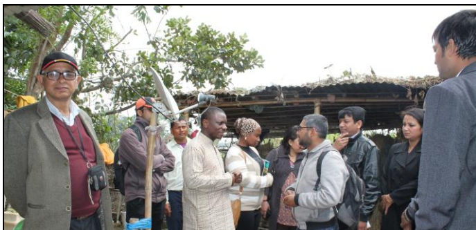
Sanitation awareness education in the Bardiya district of Nepal

We are very thankful and excited in becoming a member of IFSW. We are interested to link with social work organisations at different levels and collaborate to promote this profession for the establishment of a just and equitable society. SWAN is exploring hosting a social work and social development conference in 2016 in Nepal and is looking for other IFSW members who may be interested in either co-hosting or supporting such an event.