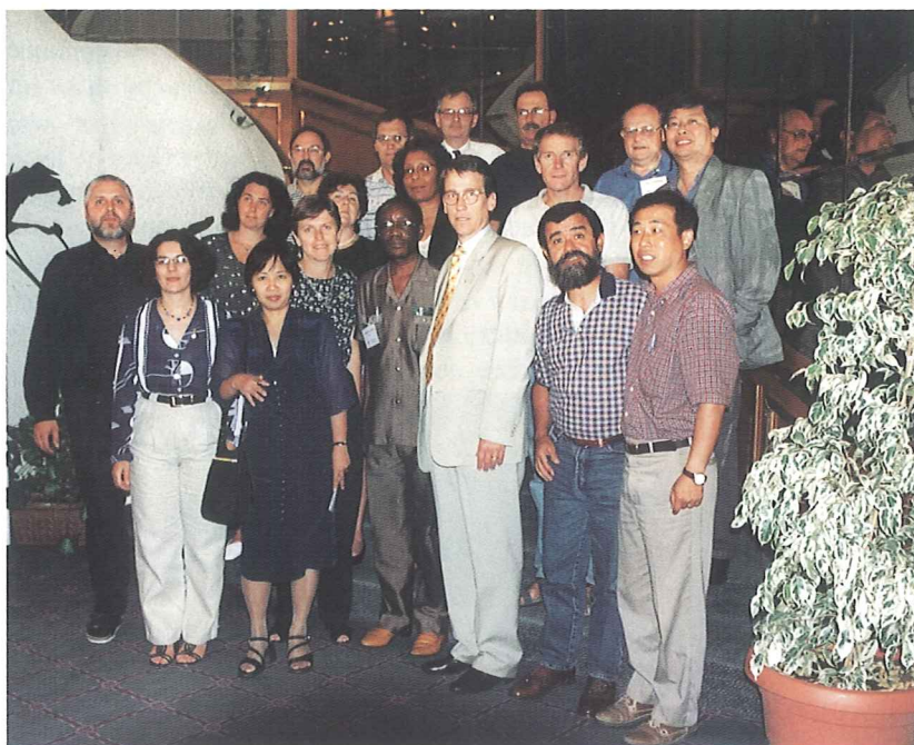
IFSW Executive Committee 1998 - 2000