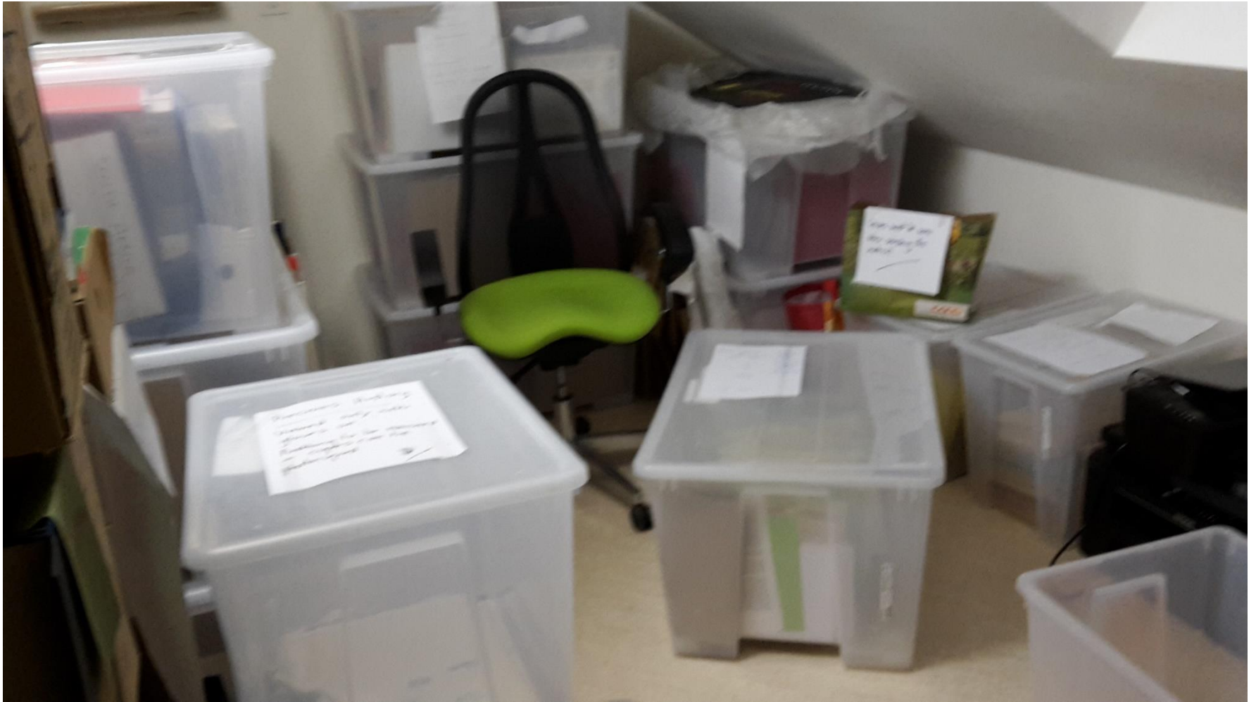
Archives' Storage in Basel