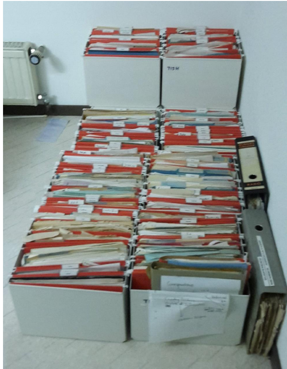
Country folders to sort